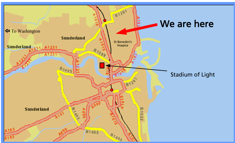
MONKWEARMOUTH HOSPITAL SITE